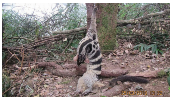
Fig. 2. ©The Biodiversity Offset Management Committee of Bolikhamxay Province, Lao PDR, Nam Chouane-Nam Xang Biodiversity Offset Site, 2018.

The pet trade/private wildlife zoos is another potential threat. Two individuals transferred from Saigon Zoo to Vinpearl's safari on Phu Quoc Island in 2018. Two males advertised online as pets for sale in 2018, confiscated and transferred to Cuc Phuong NP. One individual photographed in Zhanhuayen, Chengdu, China (well outside the native range) in February 2018 ( Fig 3. ).